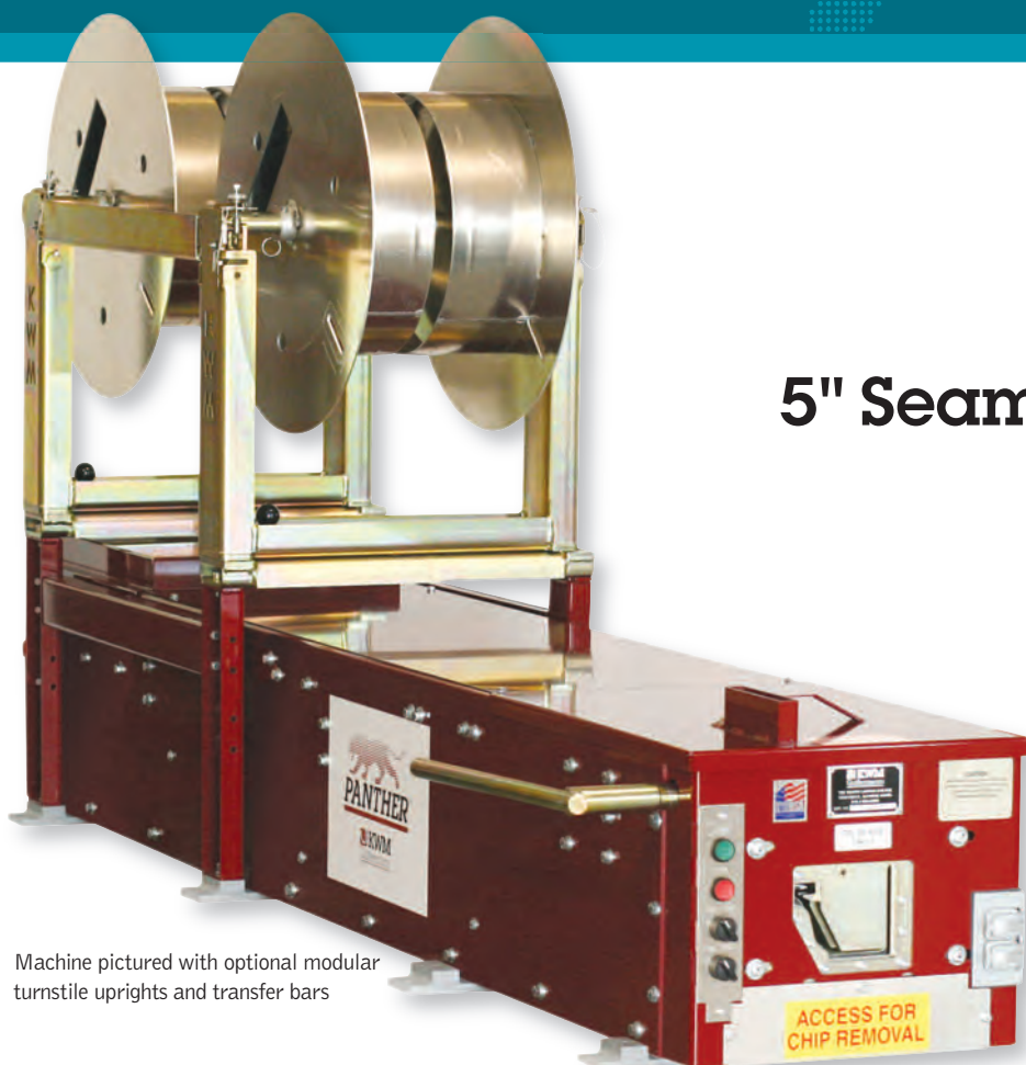
Machine pictured with optional modular turnstile uprights and transfer bars